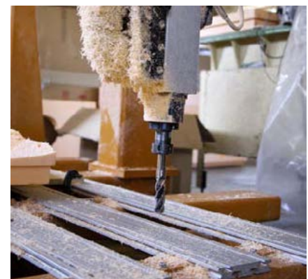
Positioning is one out of many scopes.

By using the built-in absolute positioning function and the built-in high level PLC function, a complete machine can be managed by a stand alone drive. Sensorless positioning is possible with IPM Motors.