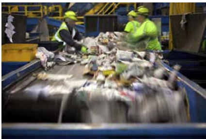
The A846 can be mounted as decentral drive to conveying systems