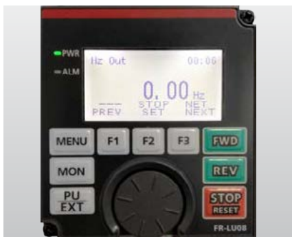
FR-LU08 as full text display with up to fifteen language and real time clock.

The operation panel with the one touch Digital Dial allows direct access to all important parameters. Select the operation panel ideal for your needs. Choose either a LU operation panel with an LCD screen offering enhanced display functionality and a clock function, or a more economical DU operation panel with a 5-digit, 12-segment display.