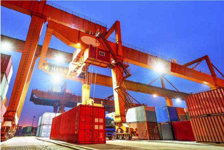
Perfect for crane applications due to built-in 100 % ED Break chopper up to 55 k