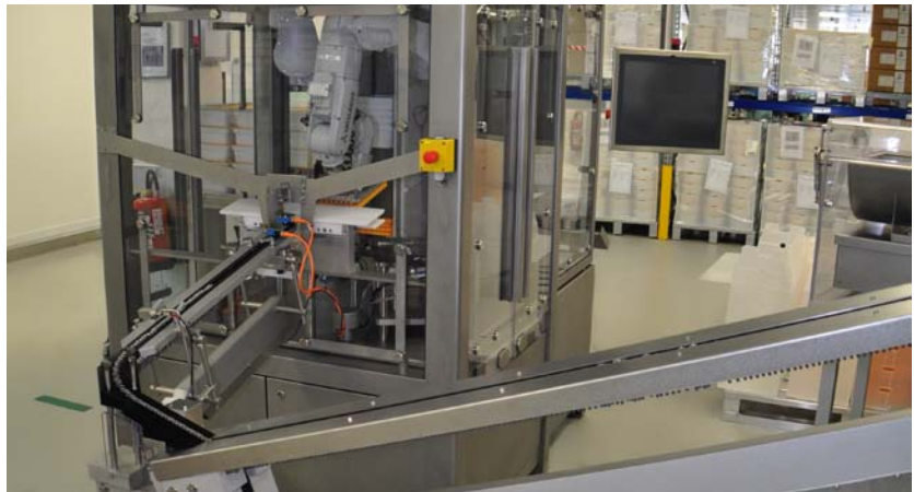
Measuring just 1.0 by 1.3 metres, the MRT basic module occupies a space slightly smaller than a europallet and is 2.20 metres high.