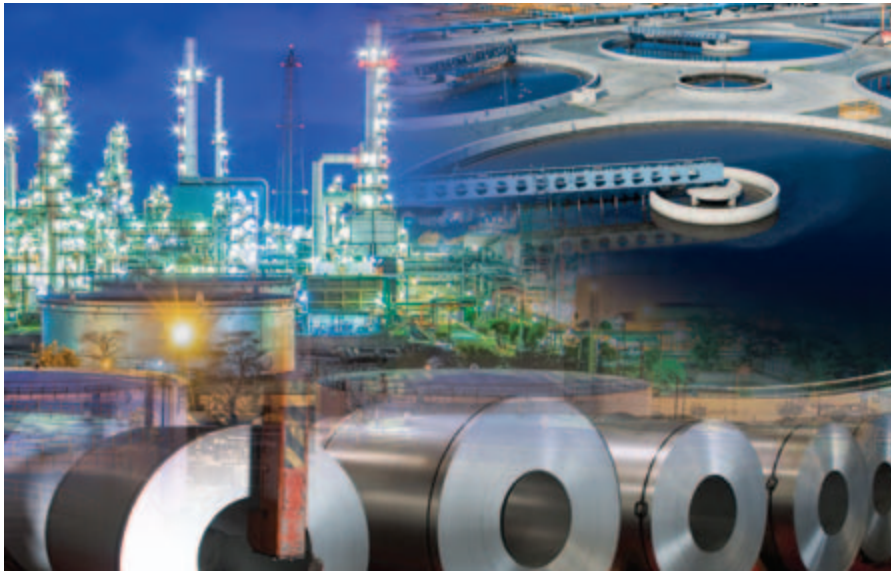
iQ Platform enables total integration of control and communications