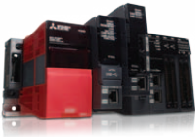
Multiple CPUs on one backplane

The iQ Platform builds on the power of Mitsubishi Electric's high performance PACs, complementing this with a broad range of control modules and network interfaces. This adaptable and powerful control platform enables companies to take a strategic approach to automation and control, allowing full integration of the plant floor operations within the business functions.